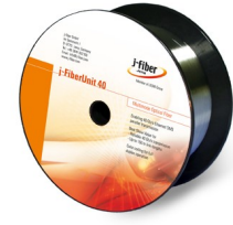
j-FiberUnit 40 spool

Please see our product datasheets at www.j-fiber.com for detailed specifications or ask our booth personell for further information